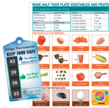
FOOD SAFETY & COOKING