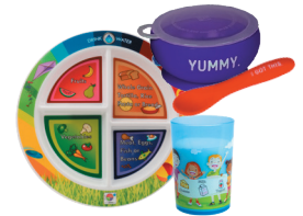
EARLY EATERS (0 - 5)